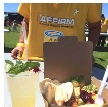
Hosted by Aranui Community Trust