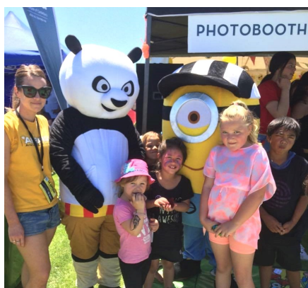
16AFFIRM WAINONI PARK

AFFIRM16 - 2017 was on December the 2nd and what a fantastic family day out!! Thank you to all involved behind the scenes, those who helped leading up to the big day and a huge thank you to you our community for showing up on such a hot, hot Christchurch summers day. The day was exactly how we envisioned, a proud community, showcasing local talent, sharing good family vibes with plenty of happy smiling faces.